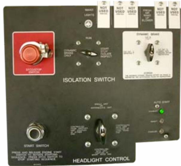
Photo depicts the AESS status portion of the engine control panel.

The EMD AESS system quickly pays for itself with reductions in fuel, maintenance and operating expenses.